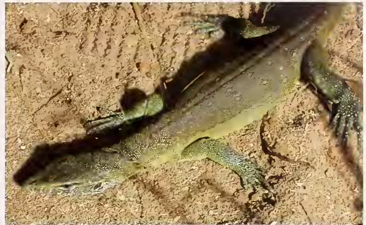
Fig. 21. Varanus niloticus , subadult, unusually light-coloured specimen from Pendjari NP.

Gongylophis muelleri – Trape & Mané (2006 b): on grid map but without specific locality.